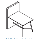
42" Table Height